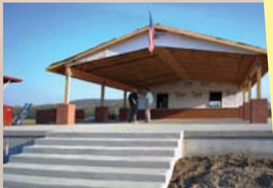
Ground-level view of pavillion under construction

To be able to take their everyday stresses of care time, surgeries and the busy schedules of doctor's appointments and so on and to just let loose and have fun and not worry. To have them feel normal and special as they are.