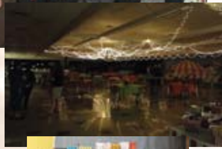
Fairfield High School After Prom efforts were aided by a grant from the Fairfield Community Foundation