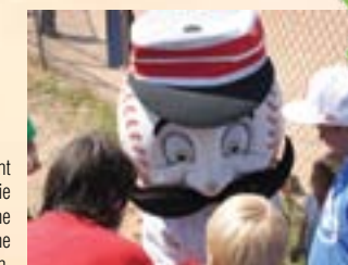
Mr. Redlegs with a participant in the local 2011 Reds Rookie Success League, a project of the Joe Nuxhall Hope Project of the Fairfield Community Foundation.