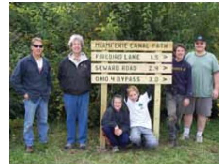
Sacred Heart's Boy Scout Troop received a grant from the Fairfield Community Foundation for their work on the Miami/Erie Canal bike path.

$5,000 Hamilton City Schools for character education $500 Community Grants Consortium $2,500