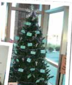
The Foundation sponsored a holiday tree in December 2010, proceeds of which went to needy families, at the Community Arts Center in Fairfield.