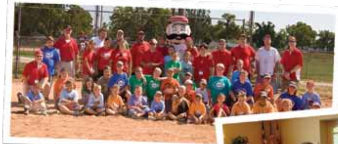
The 2010 Reds Rookie Success League