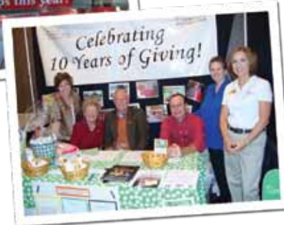
Trustees and Staff at the Fairfield Chamber Showcase