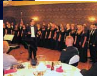
The Fairfield High School Choraliers sang patriotic songs, a highlight of the evening.

from our area were killed in the line of duty, and their family and friends established permanent memorial scholarship funds in their names at the Fairfield Community Foundation.