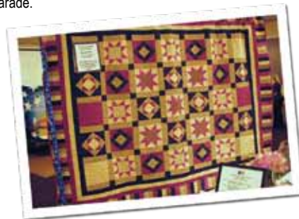
Patriotic Quilt at the 2010 Foundation Annual Celebration Auction.